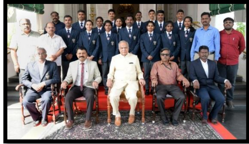
With honourable governor of tamil nadu