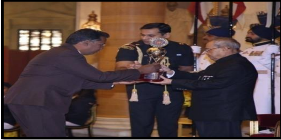
Best NSS Unit (College) JAMAL MOHAMED COLLEGE