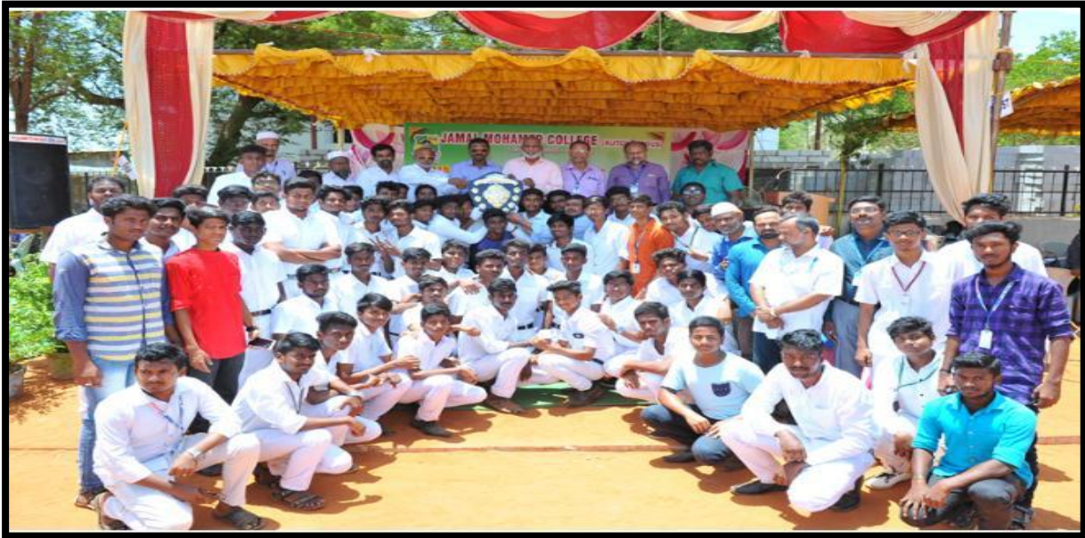
ANNUAL SPORTS MEET - OVER ALL WINNERS UP (2019)