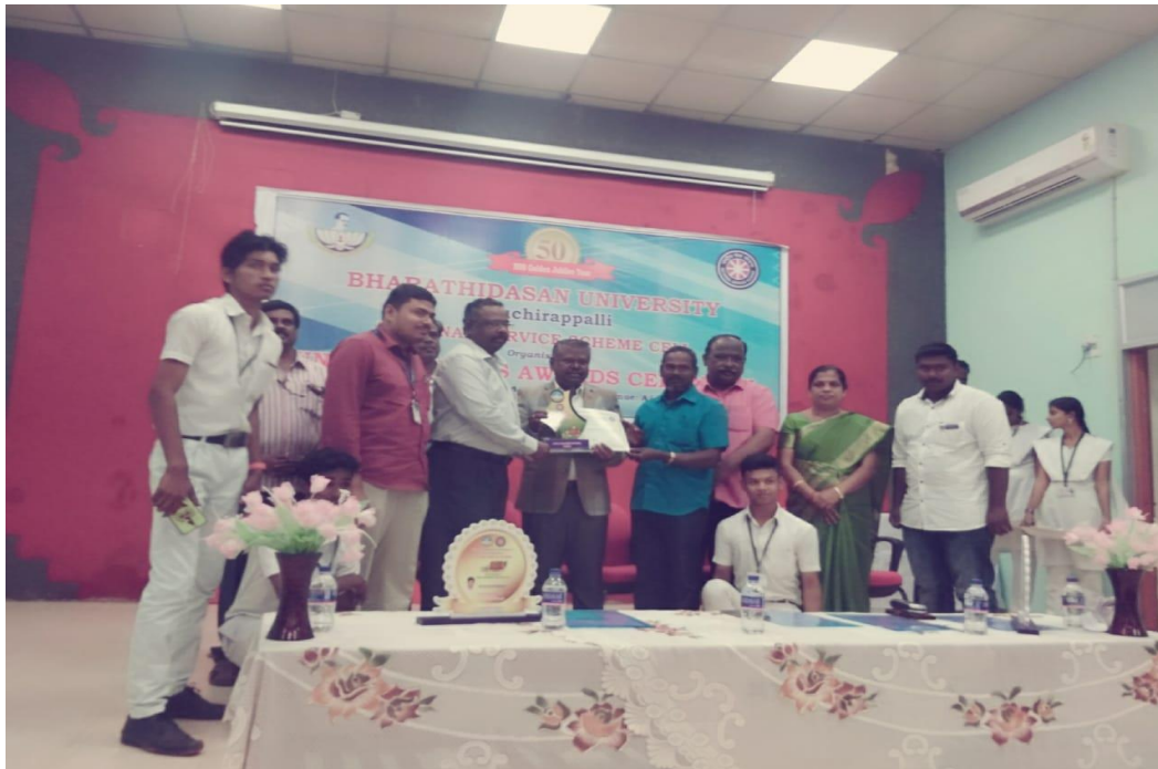
Best NSS College Award from BDU