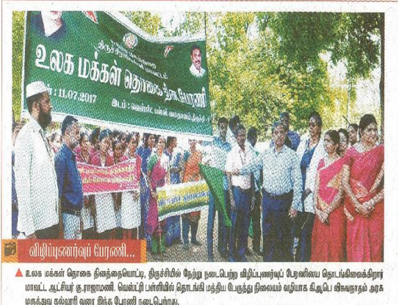
உலக மக்கள் தொழில் நுட்பம் தொடர்பான விழா நடைபெற்றது. திருச்சியில் நெற்று விழா நடைபெற்றது. மாணவர்களுக்கான பல்கலைக்கழகம் தலைநகரில் நடைபெற்றது.