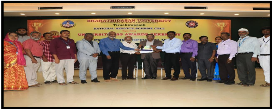
Best NSS Unit (College) JAMAL MOHAMED COLLEGE