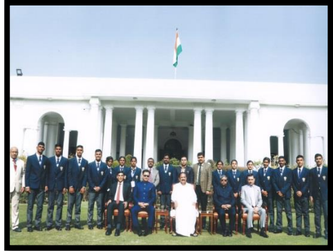
With honourable vice- president of india