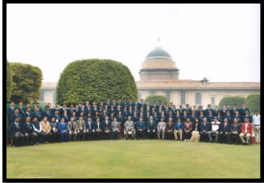
With honourable president of india