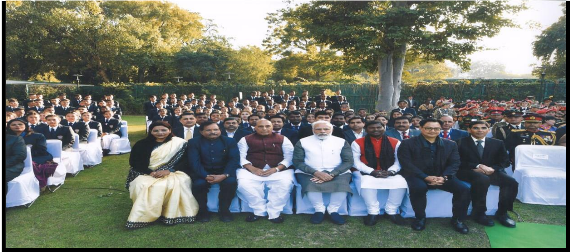
With honourable prime minister of india