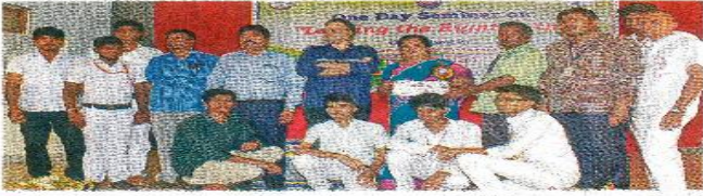
திருச்சி பாரதிதாசன் பல்கலைக்கழகம் நாட்டு நலப்பணித்துறைக்குழுமம், திருச்சி மெம்பர் கவுன்சில் இணைந்து நடத்திய கருத்தரங்கில் மாணவர்களுக்கான ஊக்குவிப்பு கருத்தரங்கம் நடைபெற்றது. மாணவர்களுக்கான பல்கலைக்கழகம் தலைநகரில் நடைபெற்றது.

திருச்சி. அக். 16 திருச்சி பாரதிதாசன் பல்கலைக்கழகத்தில் மாணவர்களுக்கான சரிபாண பாணதையை தேர்ந்தெடுத்தல் விழா நடைபெற்றது. மாணவர்களுக்கான பல்கலைக்கழகம் தலைநகரில் நடைபெற்றது. மாணவர்களுக்கான பல்கலைக்கழகம் தலைநகரில் நடைபெற்றது. மாணவர்களுக்கான பல்கலைக்கழகம் தலைநகரில் நடைபெற்றது.