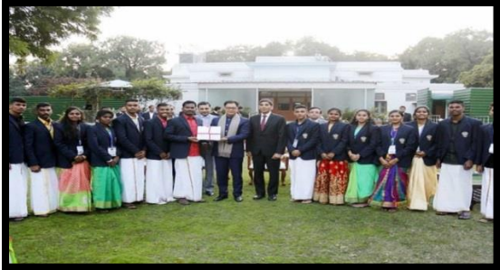
With honourable sports minster of india