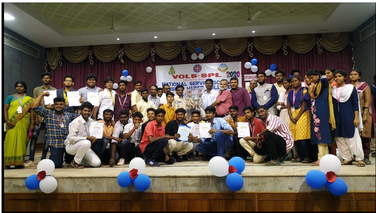
Vols Spl Competition Overall Winners up (2020)