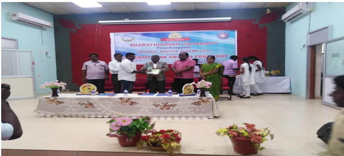
Best NSS Volunteer Award from BDU